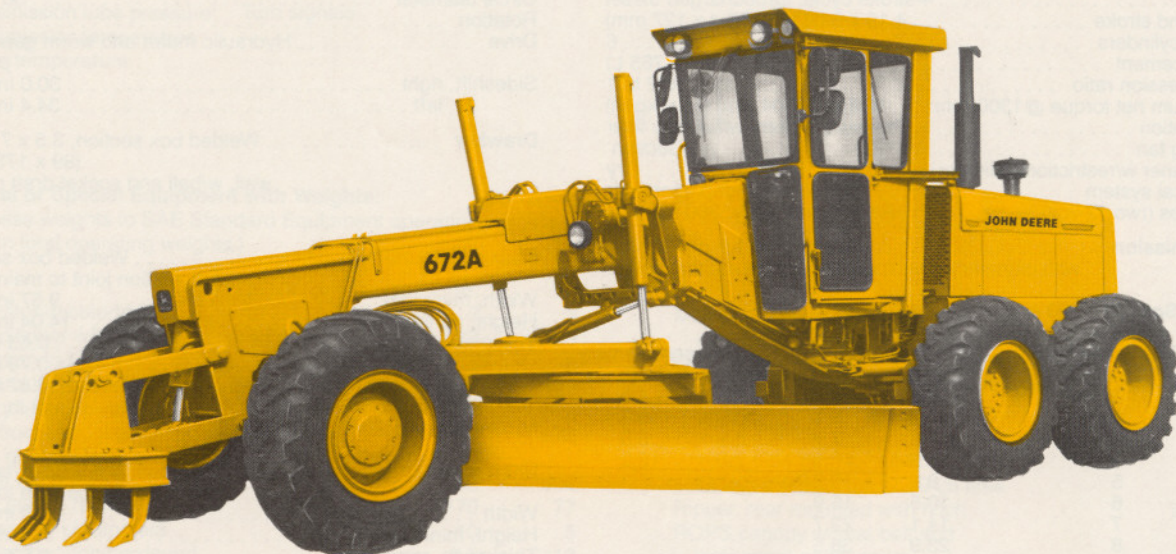
Model shown may include options